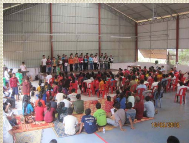
Above- Groups practice songs to be preformed at the Bunong NT dedication in May