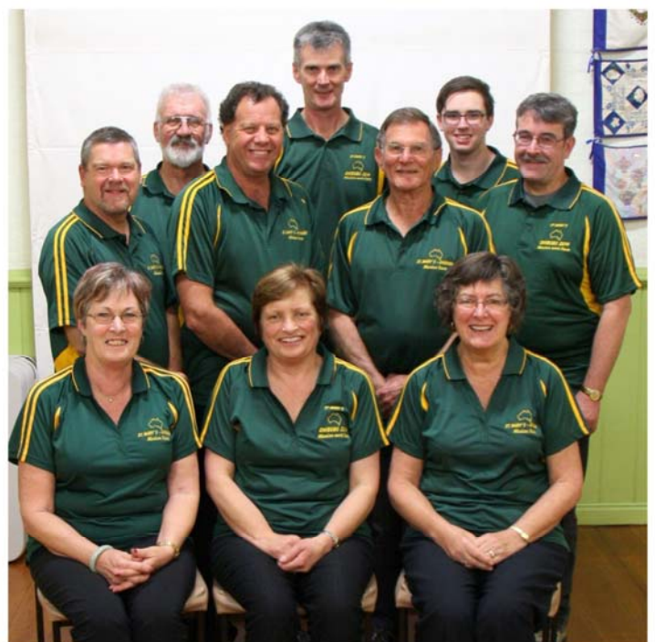
2014 Chibobo Mission Team