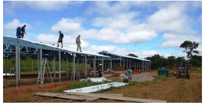
The main buildings for Stage 1 have taken shape. Well done to the Australian work team for all that they have achieved.