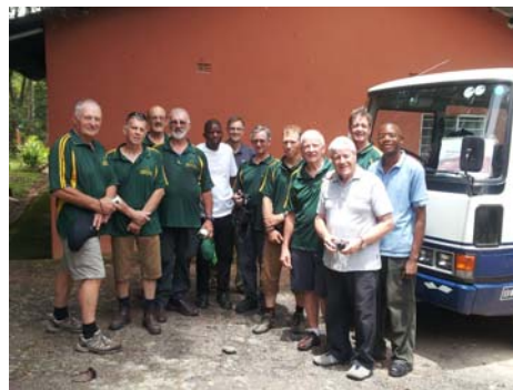
The Australian work team at Ndola, Zambia. The team included workers from Mobile Mission Maintenance (MMM), St. Mary's Anglican Church, Sunbury, Eaglehawk Uniting Church and New Peninsula Baptist Church. 2 local men from MMM Ndola also travelled to Chibobo to assist with the build.

It is being built adjacent to the current Chibobo Basic School, allowing all of the schooling from Grades 1-12 to occur in the same location.